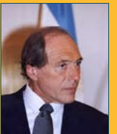
Justice Eugenio Raúl Zaffaroni Argentina Supreme Court