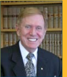
Justice Michael Donald Kirby High Court of Australia